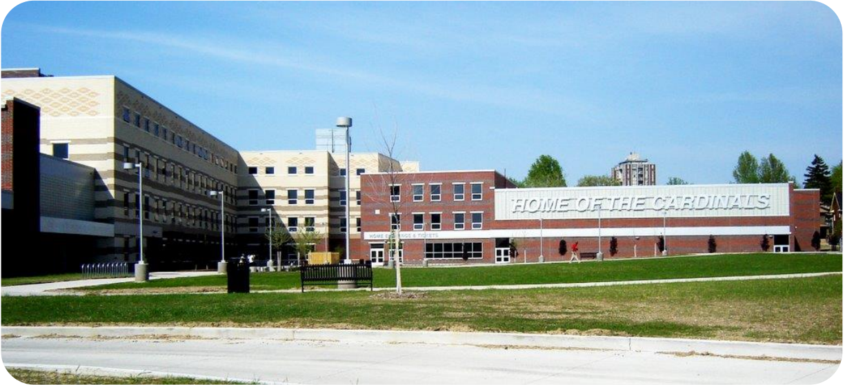
SHAW HIGH SCHOOL 15320 Euclid Avenue, East Cleveland, Ohio

10600 Chester Avenue; Penthouse # 2304 Cleveland, OH 44106