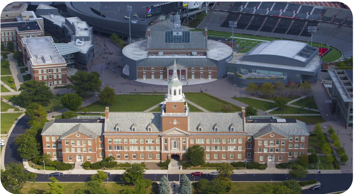
UNIVERSITY OF CINCINNATI 2600 Clifton Avenue, Cincinnati, Ohio